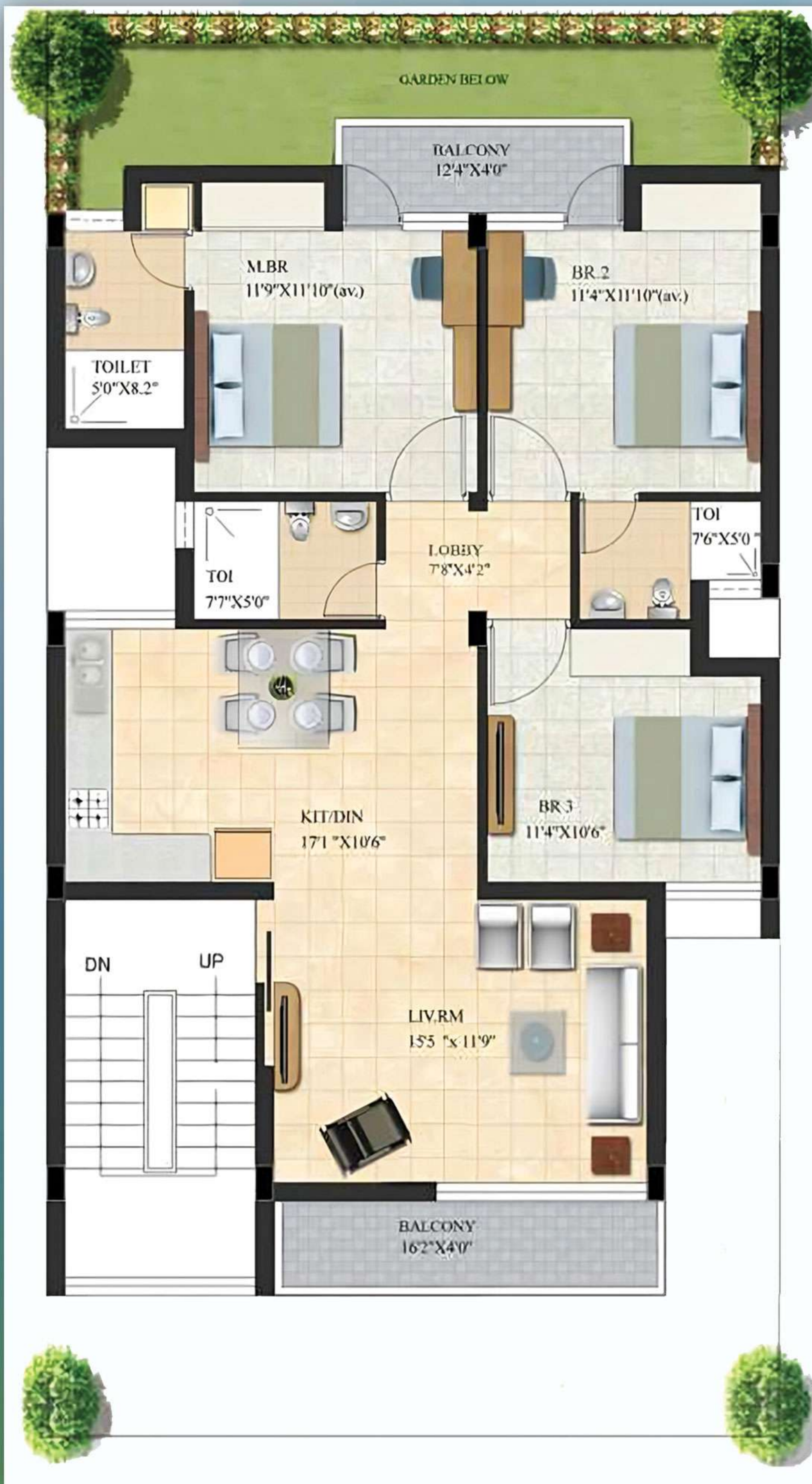
3 BHK Super Area: 1710 sq. ft. + Covered Parking