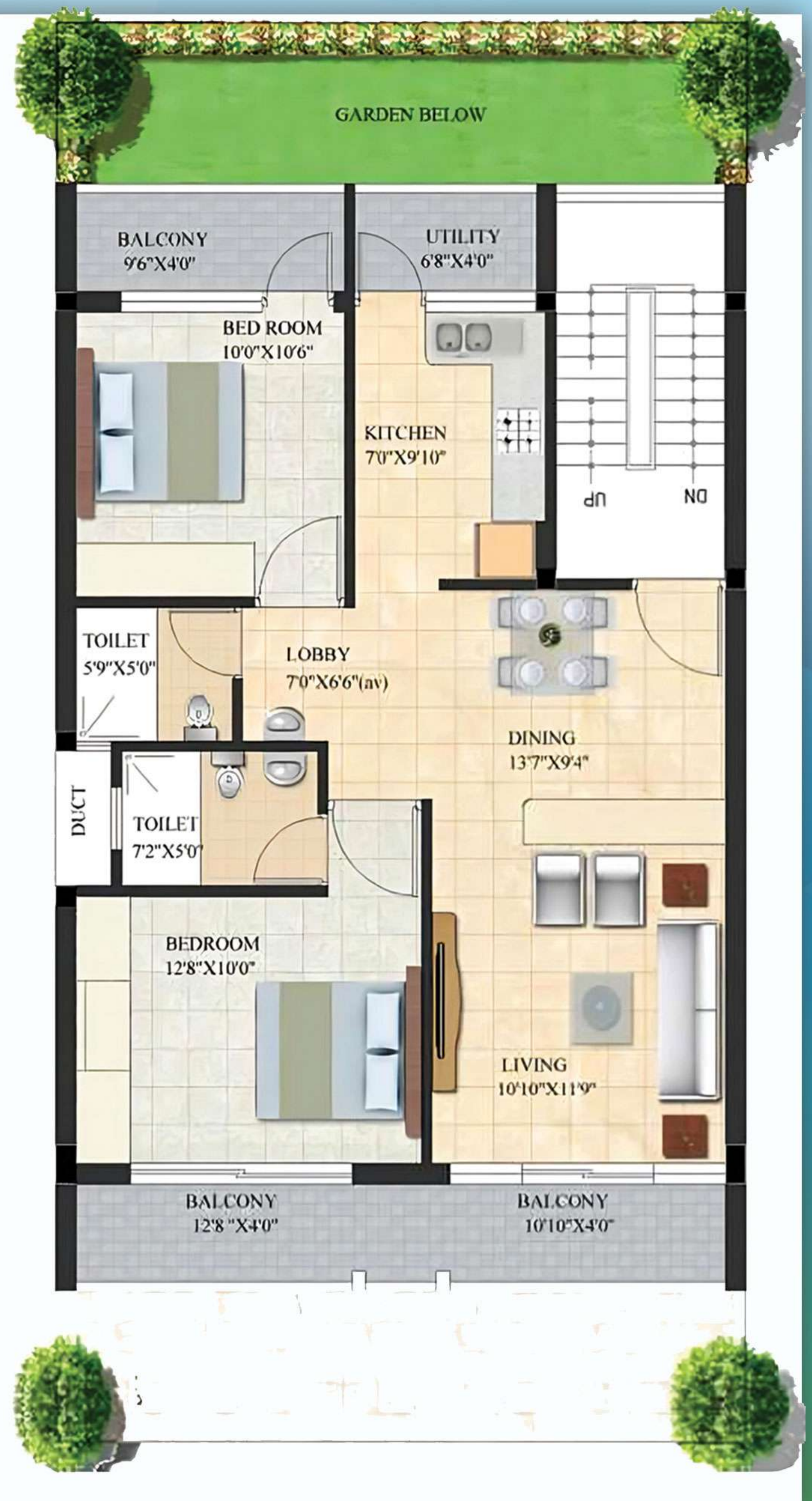
2 BHK Super Area: 1260 sq. ft. + Covered Parking